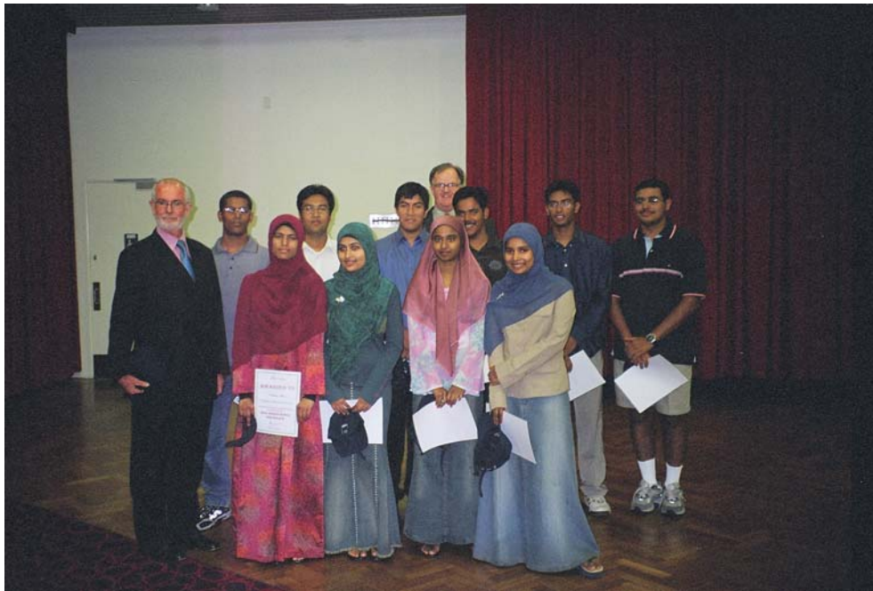
Bengali students who attended the reception at Campbelltown City Council