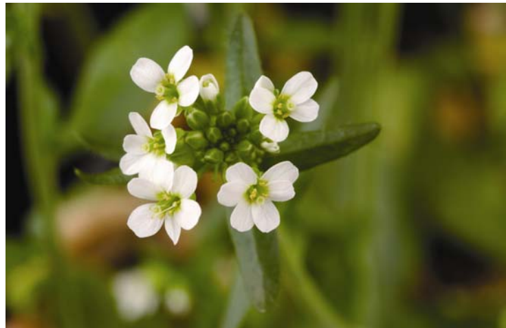
Normal Arabidopsis: it is unlikely that Arabidopsis uses 'invisible' RNA inherited from its grandparents to correct mutations.

To explain the phenomenon the researchers of the original Nature article proposed that there was invisible RNA inherited from the plant's grandparents. This proposed