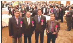
IEB Team Members

A 4-member Team of Institution of Engineers, Bangladesh (IEB) attended 2018 Japan Society of Civil Engineers