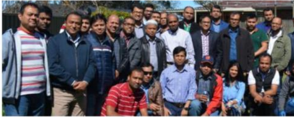
সাধারণ সভায় সমবেত প্রকৌশলীদের একাংশ

ইঞ্জিনিয়ার্স ইনস্টিটিউশন বাংলাদেশের (আইইবি) অস্ট্রেলিয়া চ্যাপ্টারের নতুন কমিটি গত রোববার (১৬ সেপ্টেম্বর) সিডনির গ্লেনফিল্ডে সংগঠনটির নতুন কমিটি গঠন সভা অনুষ্ঠিত হয়। নিউ সাউথ ওয়েলস রাজ্যে বসবাসরত বাংলাদেশি প্রকৌশলীদের সভায় সংগঠনের লক্ষ্য ও উদ্দেশ্য নির্ধারণ ও ২০১৮-১৯ সালের জন্য গঠন করা হয়।