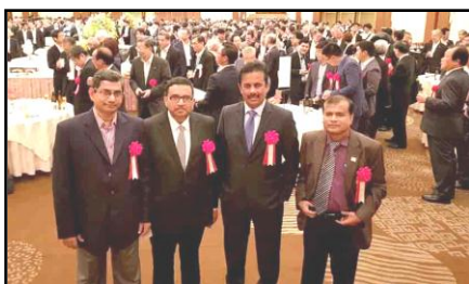
IEB Team Members

A 4-member Team of Institution of Engineers, Bangladesh (IEB) attended 2018 Japan Society of Civil Engineers