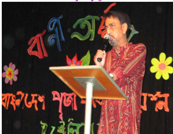
Kj wigo ARq `vk, B