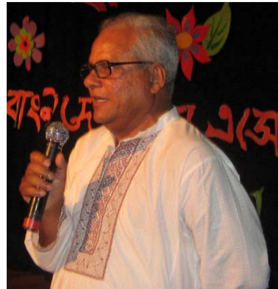
Rbre Mrgv Avāj Kw`i