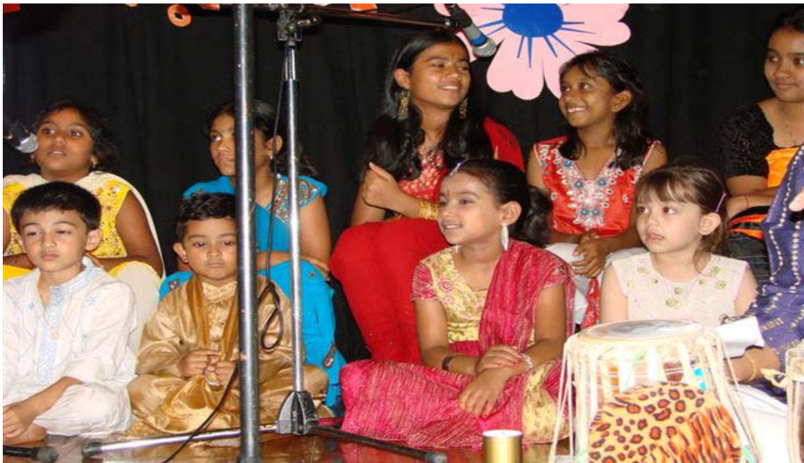
wki wki xiv mSMXZ cwi tek b Ki þQ

metktl mSMVþbi mfvcwZ AvwZ ivq Abþvþb Dcw`Z çãvb AwZw_mn mKj þK, wWwbi mKj evsj v wgmWqv Ges hvi v GB AbþvþK mdj Ki þZ wefbævte çptcvl KZv Kti þQb Zv` i þK ab`ev` I KZAZv Rwbþq I mevi Rreþb wbgf Avb I wPSh Dþb| NUvi Avkvev` e`3 Kti Abþvþbi mgwB tNvl bv Kti b|