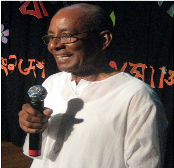
Rbre bRi`j Bmj vg