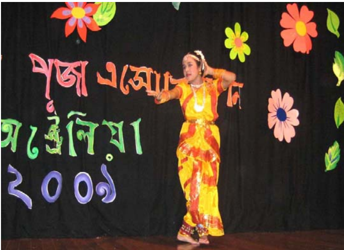
Ki tēkb cwi bZ f` epó