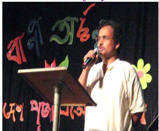
W. mgxi mi Kvi