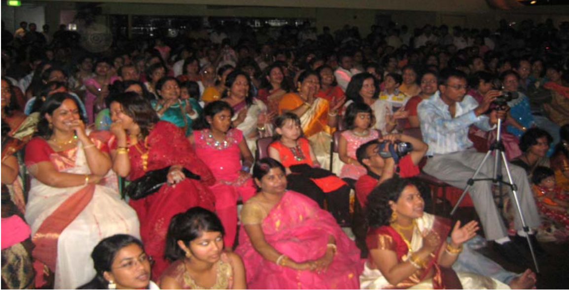
Abpirtb Dcw Z mpxRb